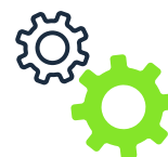
Science & Engineering