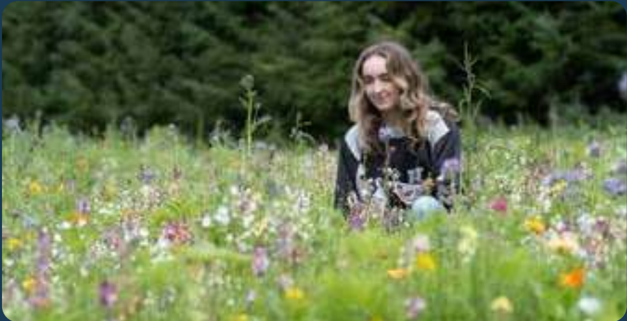
Sustainability is at the core of everything we do.